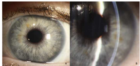
Figure 2. A. Right cornea demonstrating resolution of punctate epithelial keratopathy and B. anterior basement membrane changes. Findings in left cornea also resolved (not shown here).