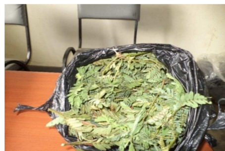
Figure 1. Fresh leaf sample of Cassia nigricans .