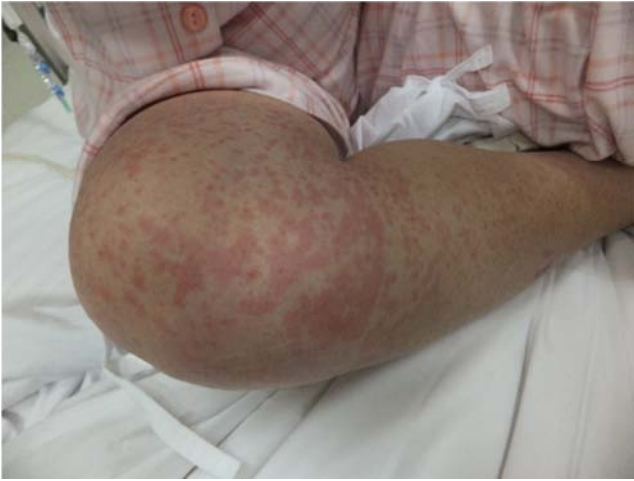
Figure 3. Maculopapular eruption of her knee (day4).

maculopapular eruption of her trunk and extremities after re-exposure to LTG 25mg on day4.