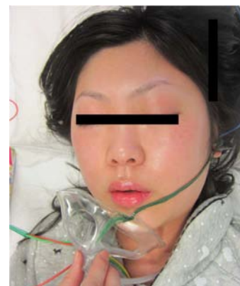
Figure 2. Facial edema (day3).

CTRX: ceftriaxone, LTG: lamotrigine, PSL: prednisolone, mPSL: methyl-prednisolone, NPPV: non-invasive positive pressure ventilation facial edema, especially bilateral eyelids' edema on day 3.