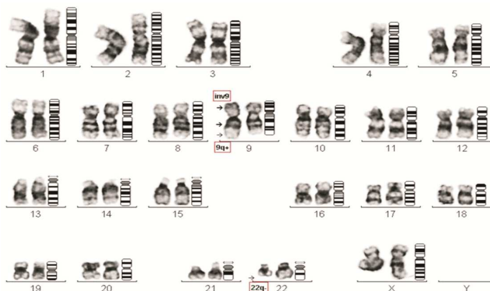
Fig. 1. G-banded karyotype of patient no. 1 shows chromosome complement of 46XX,inv(9) (p11; q13), t(9;22) (q34; q11.2).

CP-CML - Chronic myeloid leukemia – chronic phase